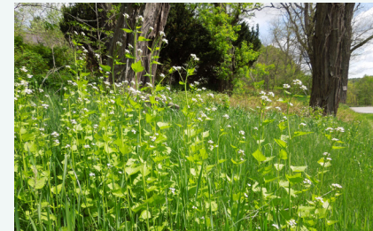
A STAND OF GARLIC MUSTARD

Fast facts: Tolerates sunlight but prefers dark, moist environments. Seeds can remain viable for over seven years. Leaves smell like garlic when crushed. Releases chemicals harmful to soil fungi that are important to native trees.