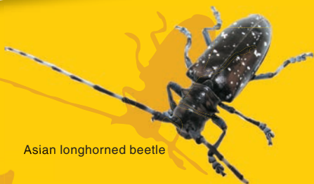
Asian longhorned beetle