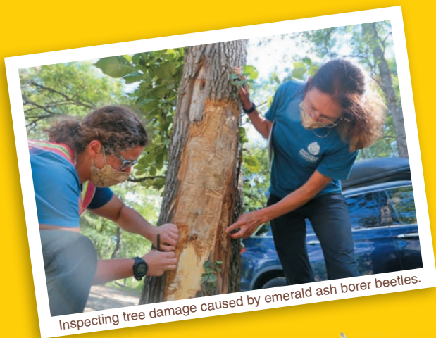
Inspecting tree damage caused by emerald ash borer beetles.

Prevention is the key. Buy firewood near where you will burn it. Don't move firewood when you travel, camp or visit another area.