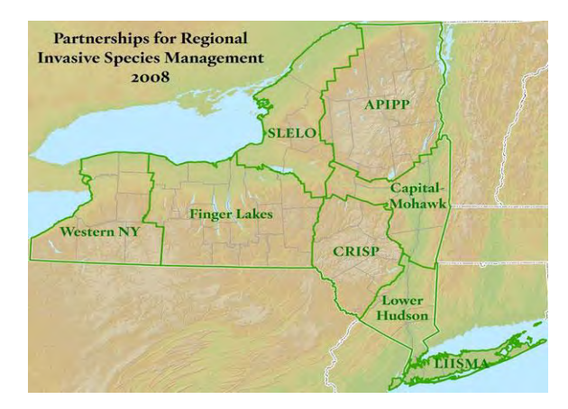
Figure 1. Eight Partnerships for Regional Invasive Species Management are in NY.

The Adirondack PRISM encompasses approximately 10,244 square miles and includes 12 counties and 119 towns. Counties having portions within the PRISM are St. Lawrence, Lewis, Oneida, Herkimer, Fulton, Saratoga, Warren, and Washington. Counties located entirely within the PRISM include Hamilton, Essex, Franklin, and Clinton.