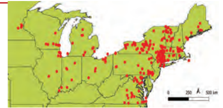
▲ Recorded sightings of jumping worm (red) in the Northeast and Midwest U.S. Data from iMapInvasives (2020).

upper organic layer of soil, which leaches nutrients and erodes the ground. This makes it hard for many plants (including garden plants) to grow and threatens even the most well-tended lawns. What's worse—humans spread worms without realizing it, carrying jumping worm egg cases (cocoons) in soil, mulch, potted plants, landscaping equipment, and even the treads of shoes and tires.